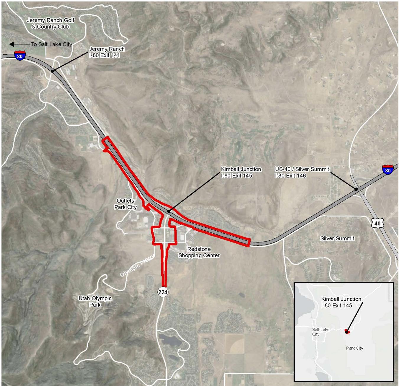
Figure 1-1. Needs Assessment Evaluation Area